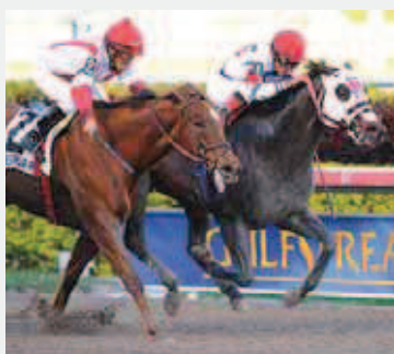
APRIORITY