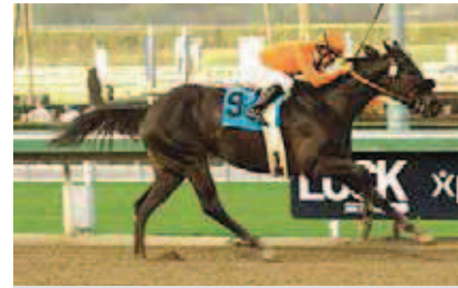
TEDDY'S PROMISE

we could win tomorrow. They wanted to go for the big show and I couldn't argue with them."